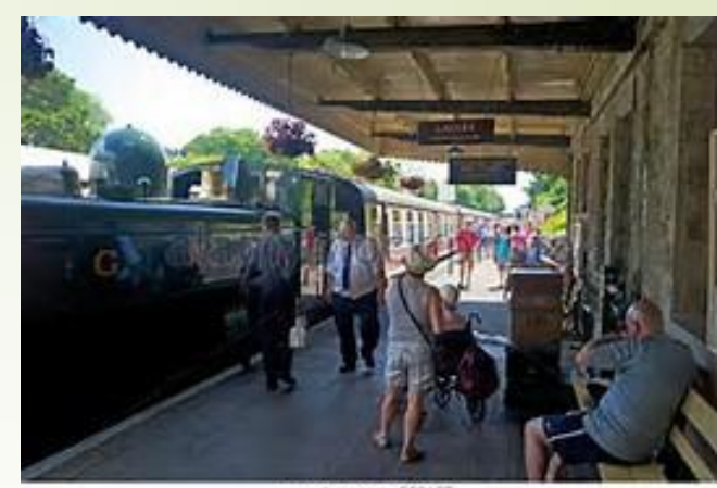
www.atarry.com - ESP1CT